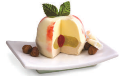
Apple Dessert 6.50

Concealed within a chocolate coating is a layer of refreshing chocolate and caramel gelato and a layer of luscious caramel fudge.