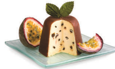
Passionfruit Dessert 6.00

A delightful harmony of chocolate gelato and almonds covered in dark chocolate and topped off with a cherry.