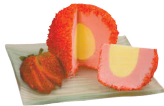
Fire Ball 6.00

A delicious layer of both tiramisu gelato & coffee liquored sponge, topped with zabaglione gelato with a sprinkling of vanilla almonds.