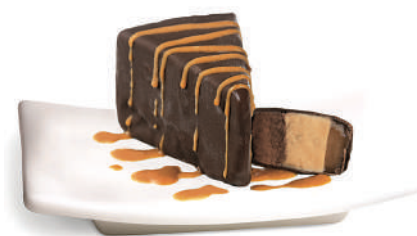
Caramel Choc Delight 6.00

Coffee gelato covered by vanilla gelato which is rolled in coconut flakes and crowned with a cherry.