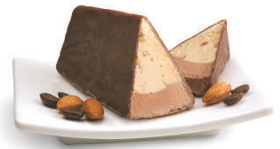
Special Mocca 6.00

Hazelnut and 'zuppa inglese' gelato with a centre of cherries & liquored sponge, engulfed by a layer of white chocolate.