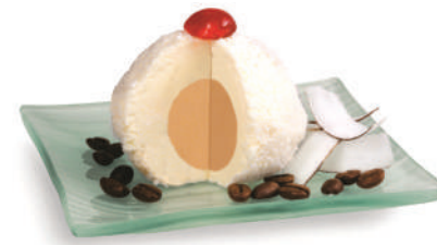
White Tartufo 6.00

Exquisite passionfruit gelato veiled by a layer of rich dark chocolate.