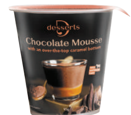
Chocolate Mousse 3.50

Hidden beneath a rich dark chocolate coating you'll find chocolate gelato and coffee gelato laced with almond pieces.